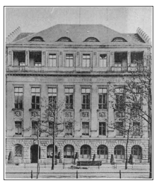
Vereinshaus Deutscher Apotheker, Berlin.